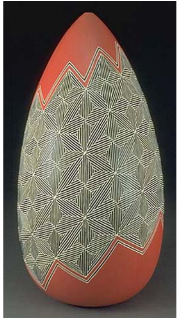
Untitled" Pecan: turned, carved, and painted 19"h x 10" diameter