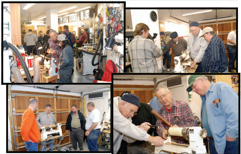
I am sure that all who attended enjoyed themselves and learned something.