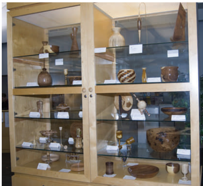
Part of the Greenville Library Display