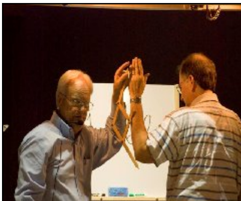
A nice start on the toy project