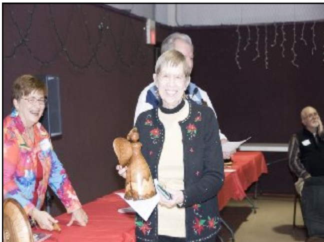
There was some very heated bidding for this angel