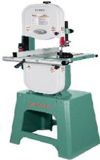
Grizzly G0555 14" Bandsaw