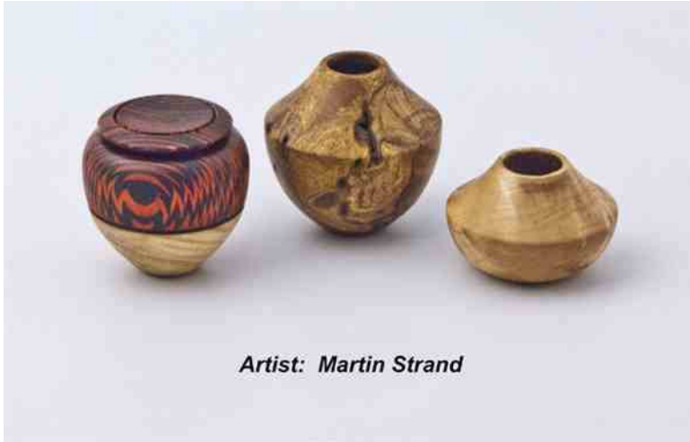
Artist: Martin Strand

PLEASE go to the website to view all the wonderful items. It is impossible to include all of the wonderful show and tell items. This is a sample of what you miss seeing when you don't attend meetings.