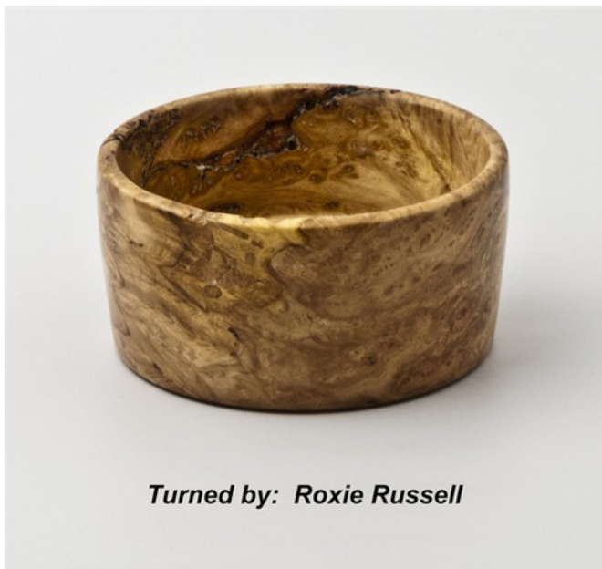
Turned by: Roxie Russell