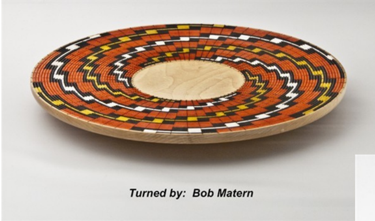
Turned by: Bob Matern

PLEASE go to the website to view all the wonderful items. It is impossible to include all of the wonderful show and tell items. This is a sample of what you miss seeing when you don't attend meetings.