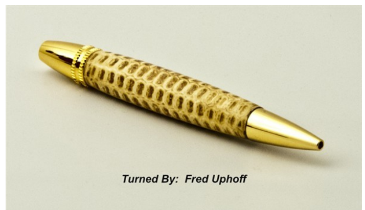
Turned By: Fred Uphoff