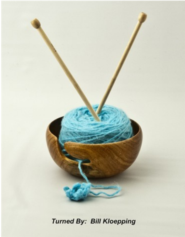
Turned By: Bill Klopping

You guys are making it harder and harder to select pictures for the newsletter. PLEASE go to the website to view all the wonderful items. It is impossible to include all of the wonderful show and tell items. This is a sample of what you miss seeing when you don't attend meetings.