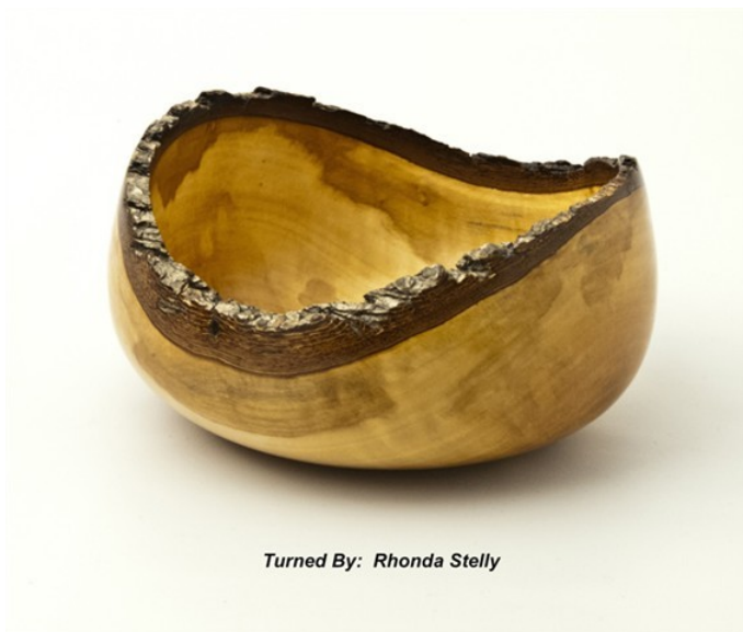
Turned By: Rhonda Stelly