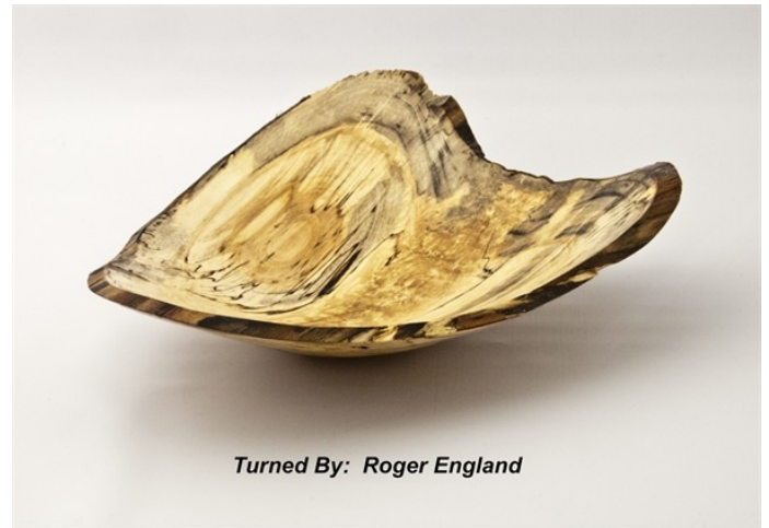
Turned By: Roger England

▼ Roger likes to work with unusual shapes.