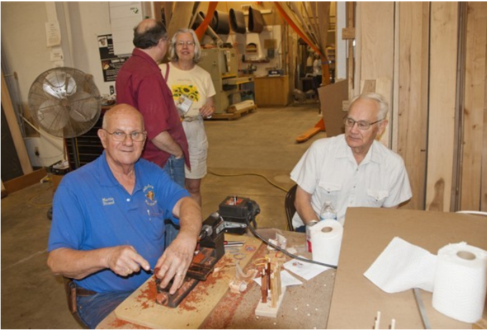
▲ Lots of activity on both sides of the lathes.